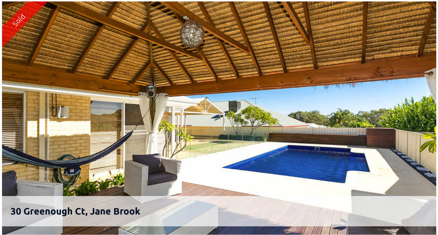
30 Greenough Ct, Jane Brook