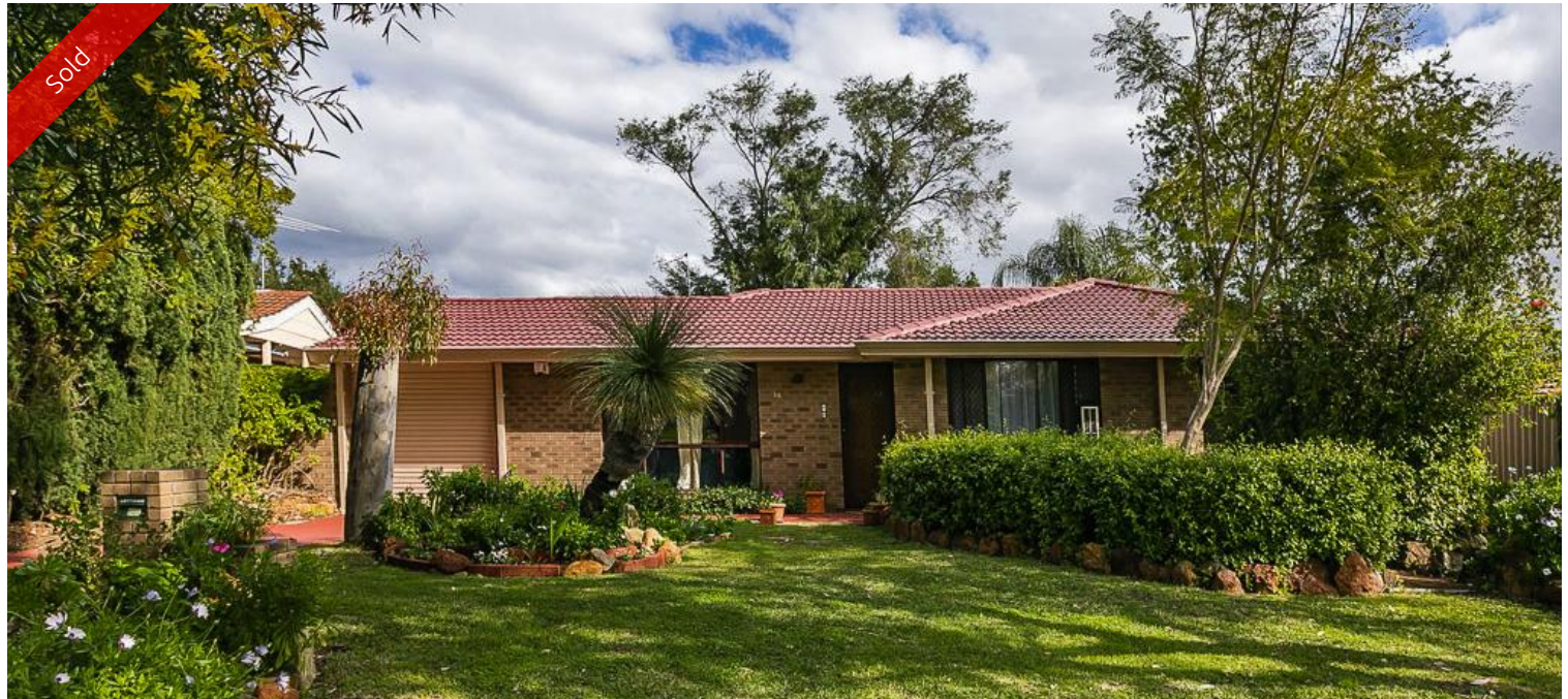
16 Northend Cl, Swan View