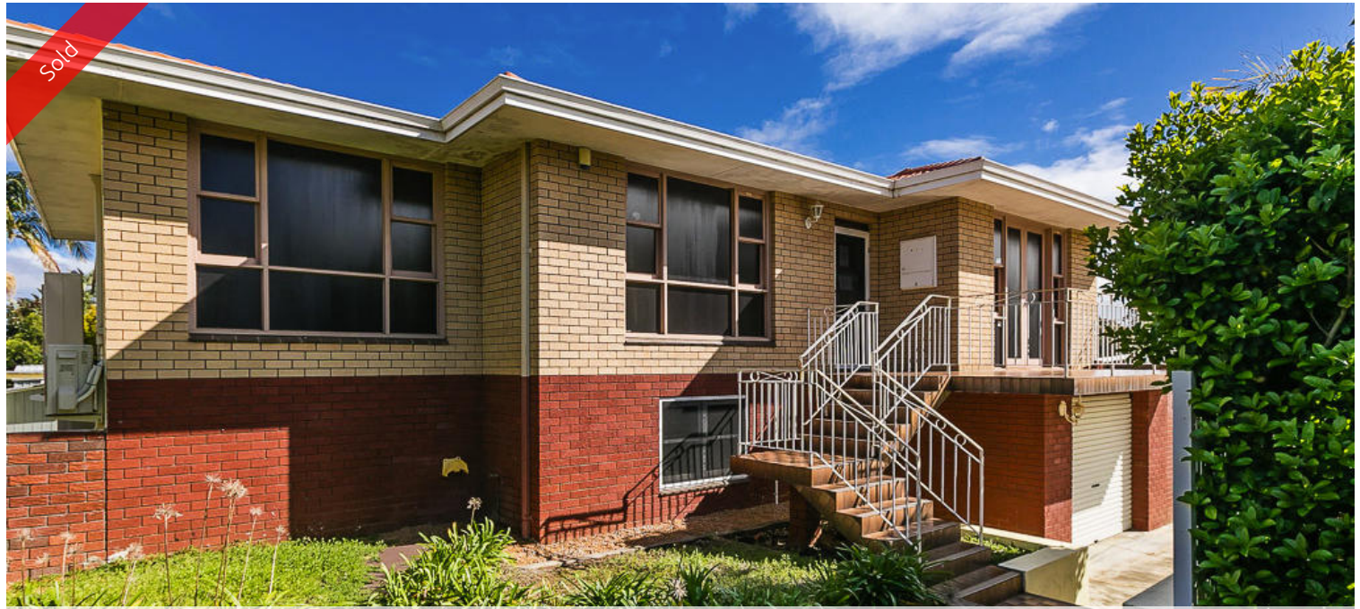
195 Viveash Rd, Swan View