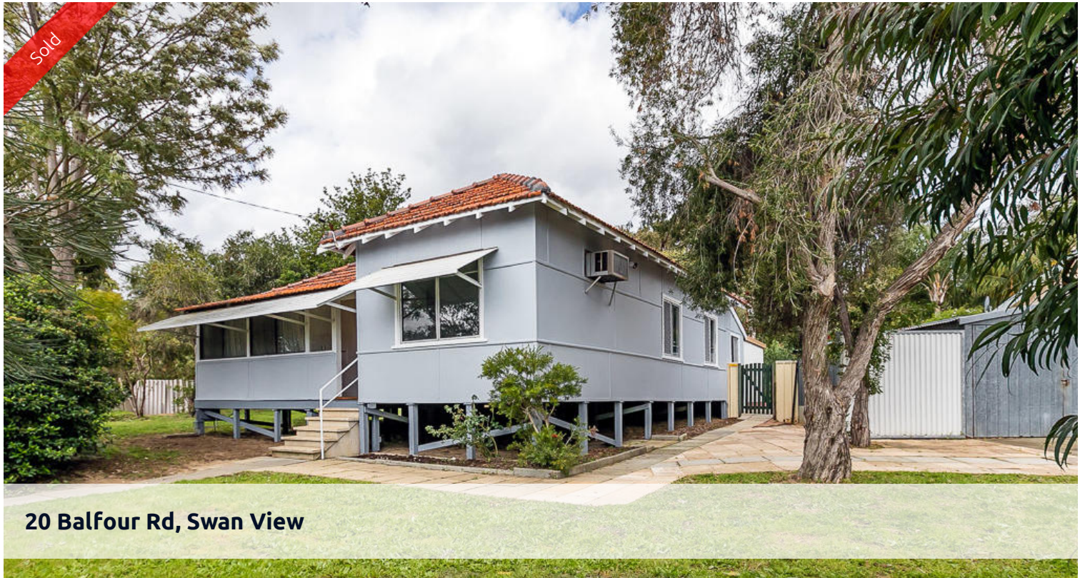
20 Balfour Rd, Swan View