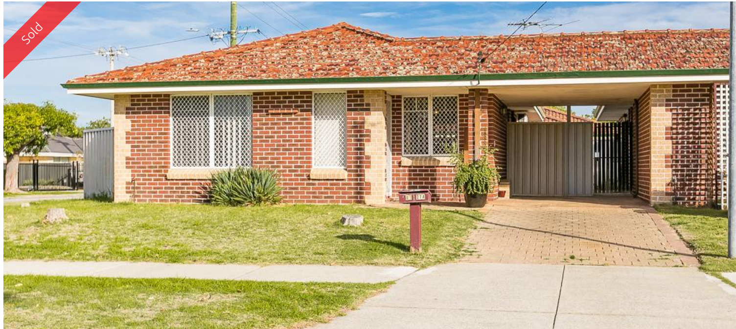
Unit 1, 27A Mathoura St, Midland