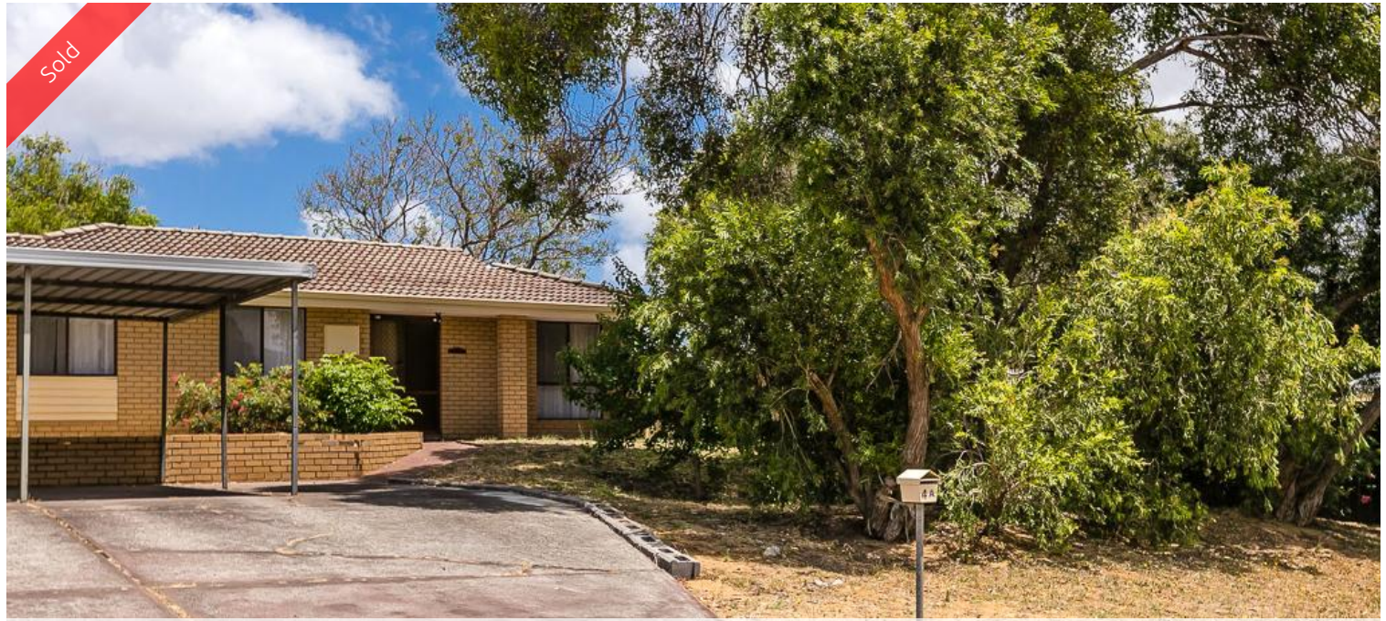
4A Markham Way, Swan View