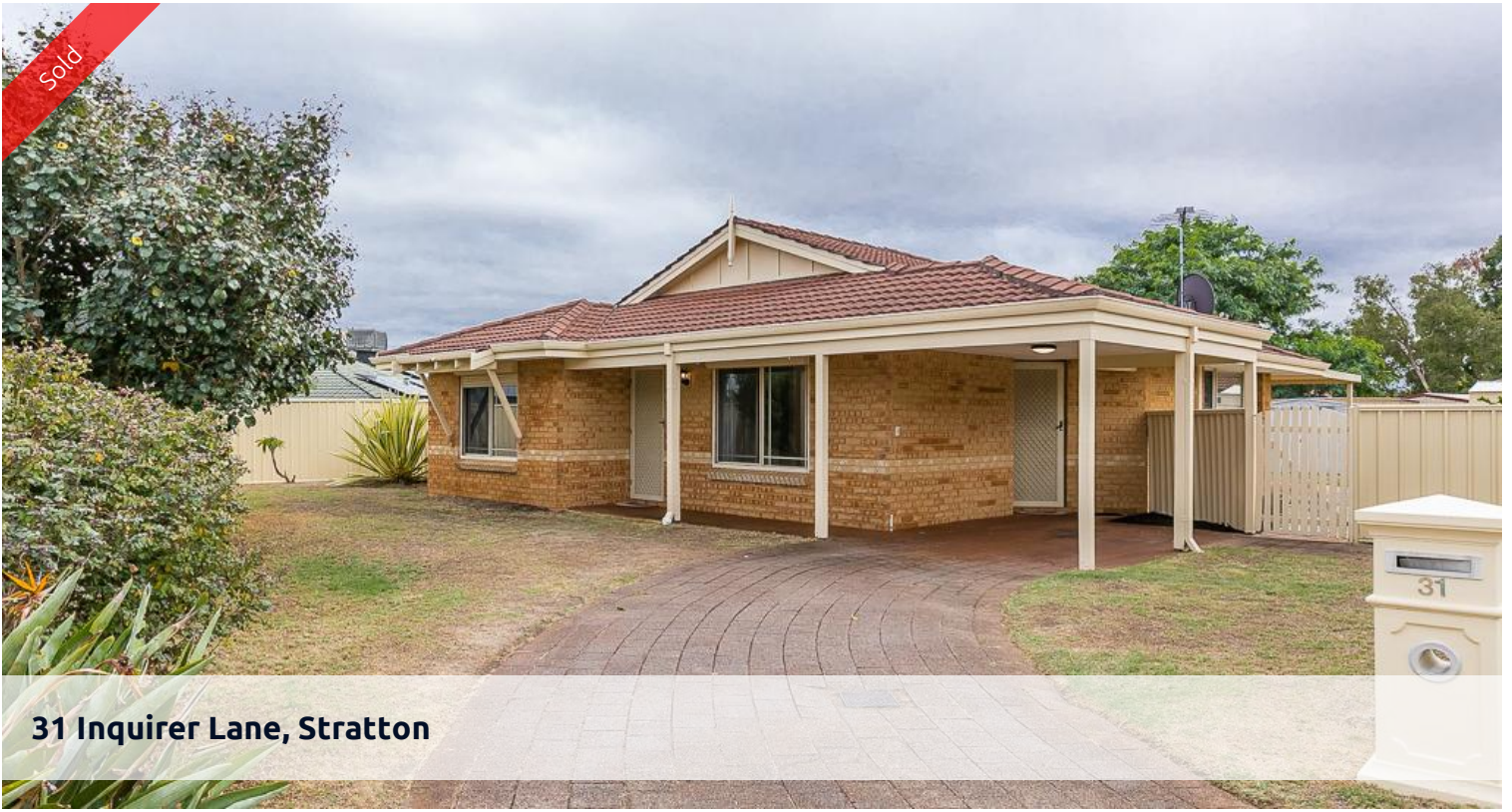
31 Inquirer Lane, Stratton